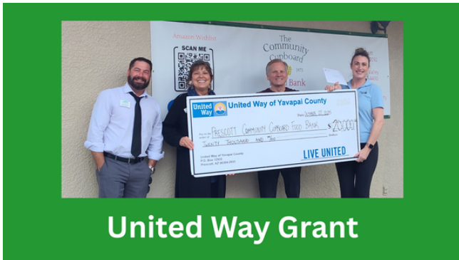
United Way Grant