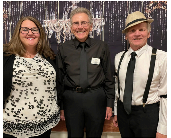
Board Members attended the United Way Community Builder's fundraising event