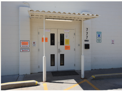
New PCCFB building front entrance