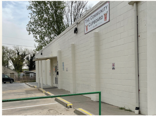
New PCCFB building front.