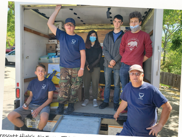
Prescott High's Air Force JROTC - doing the "heavy lifting" on moving day!