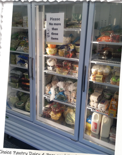
Choice Pantry Dairy & Prepared Foods Refrigerator Case