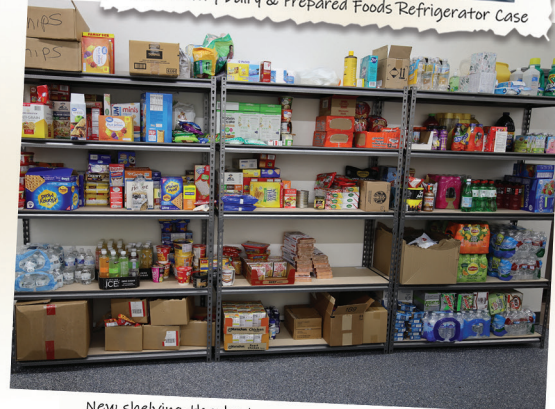
New shelving thanks to our generous grantors.