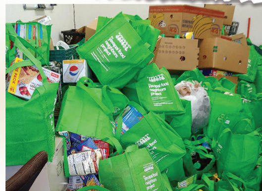
Yavapai Food Neighbors - Green Bag Food Drive