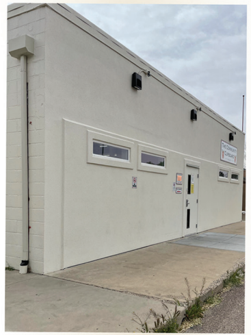
New PCCFB building side entrance.